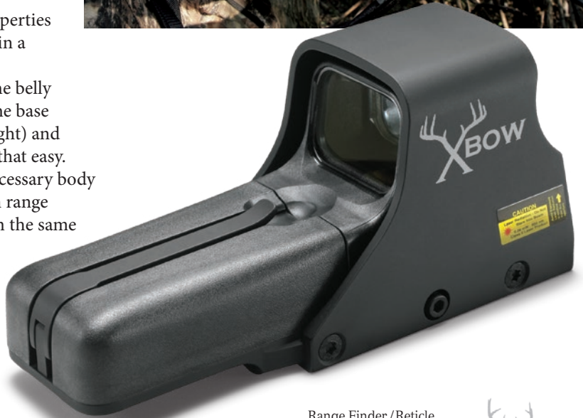
Range Finder / Reticle